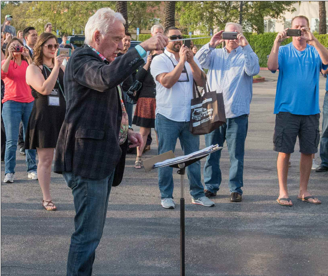
Above: Doc Severinsen conducts the World Record Fanfare group on the Olympic Fanfare . Below: Arturo Sandoval