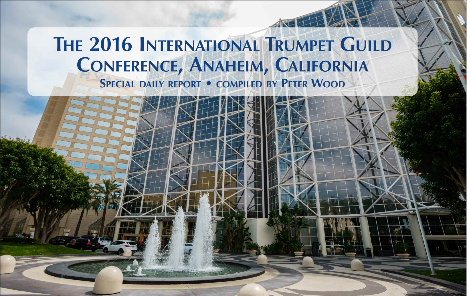
The Hyatt Regency Orange County, site of this year's conference

SPECIAL DAILY REPORT • COMPILED BY PETER WOOD