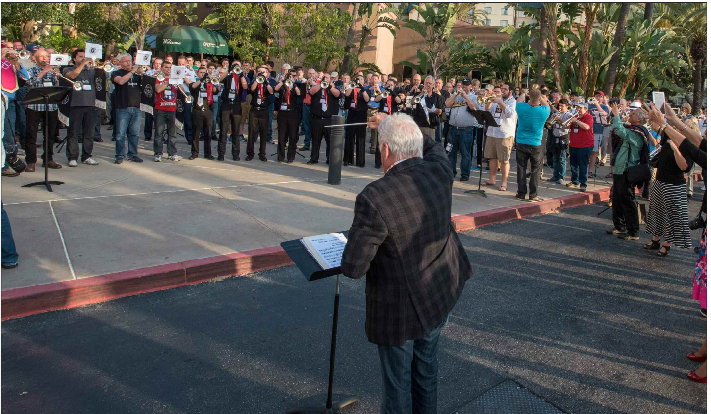
Below: Doc Severinsen conducts the World Record Fanfare group on the Olympic Fanfare.