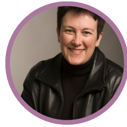
Jennifer Higdon Trumpet Songs