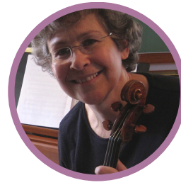
Elaine Fine Sonata for Trumpet and Piano